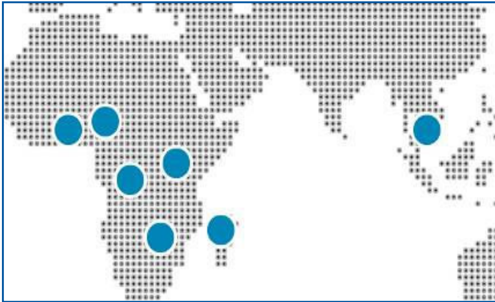
Figure 1 Map of countries included in the project.